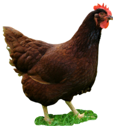
Rhode Island Red